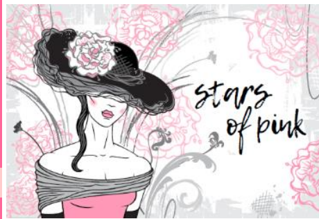
Table Captain Party ~ Tuesday, June 27

Will you sell a table of ten for the upcoming Stars of Pink Fashion Show? The show will be held on Saturday, October 14 at the Indianapolis Downtown Marriott.