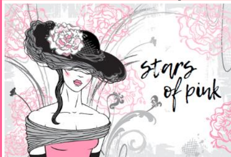
Table Captain Party ~ Tuesday, June 27

Will you sell a table of ten for the upcoming Stars of Pink Fashion Show? The show will be held on Saturday, October 14 at the Indianapolis Downtown Marriott.