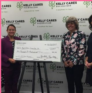
Kelly Cares Foundation selects PRC to receive $9,600 grant!